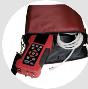
Convenient nylon bag