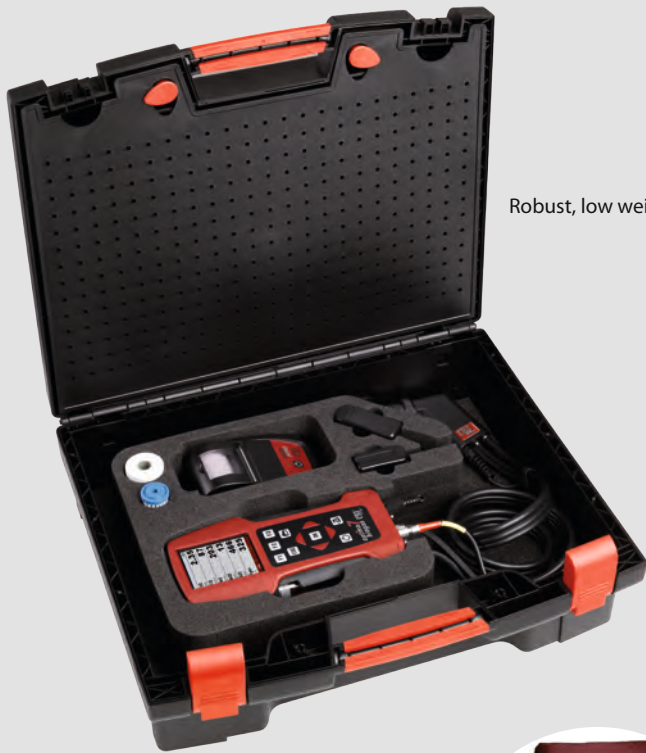
Robust, low weight case