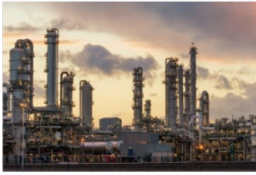
▲ Petrochemical & Chemical Industry