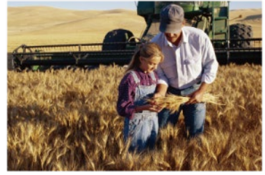
▲ Agricultural & Environmental Protection