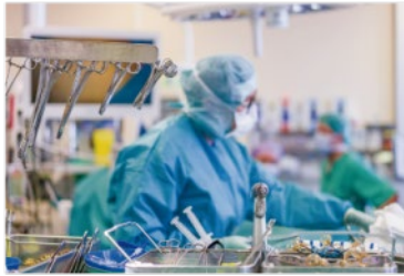
▲ Food & Pharmaceutical Industry