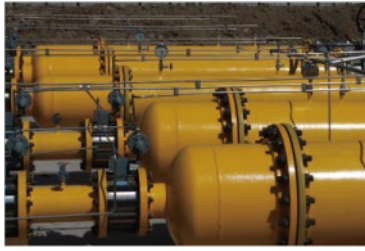
▲ Municipal Engineering & Utilities