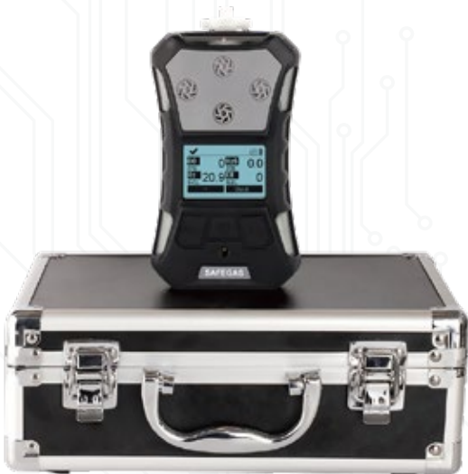
SKY3000 — Portable gas detector

SKY3000 series is a high-performance portable gas detector that can detect multiple gases (Oxygen compounds VOC, combustible gas and toxic gas) at the same time and has man down alarm function. The device has humanized operation functions such as one-key security detection, one-key storage, automatic image flipping, as well as the man down alarm function; With optional Bluetooth transmission function, allowing safety personnel to obtain real-time data and the alarm status. It has obtained international IECEx, ATEX explosion-proof certification and Chinese explosion-proof certification; As it passed the antistatic test, and the protection level reaches IP67; With safer product design and the module design which makes the detection faster, and the compact ergonomic design makes the device easy carrying; The instrument is mainly working in suction mode. When the air pump fails or in special emergency situations, it can automatically switch to the diffusion sampling method, thereby improving the protection to a new Level.