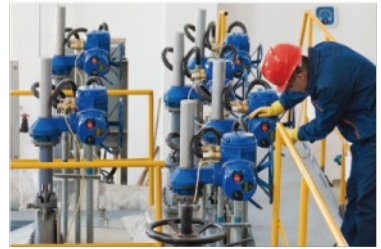
▲ Other Industries